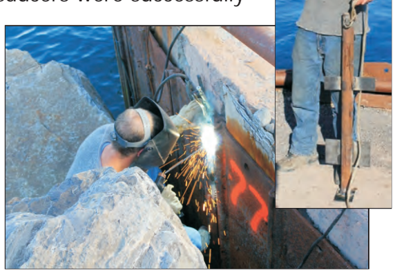
photo - welding the housing to the sheet pile wall above water for the atmospheric gauge. insert - steel housing.

"Reliable Rentals at Reasonable Rates" Check out our rates at www.aslenv.com Largest oceanographic equipment lease pool in North America!