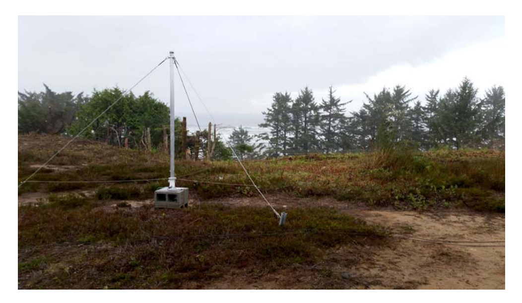
Figure 2: One of twelve 2 m-tall receive antennas.

The figure below shows the first ocean current radial velocity data out to 85 km from shore as of March 27, 2015.