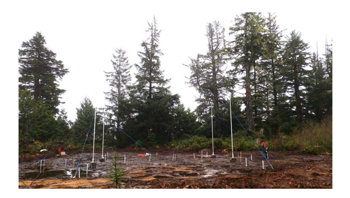
Figure 1: Installation of the transmit array.

The figure below shows the transmit array; the Pacific Ocean is situated behind the trees. The lower figure shows one of twelve 2 m-tall receive antennas.