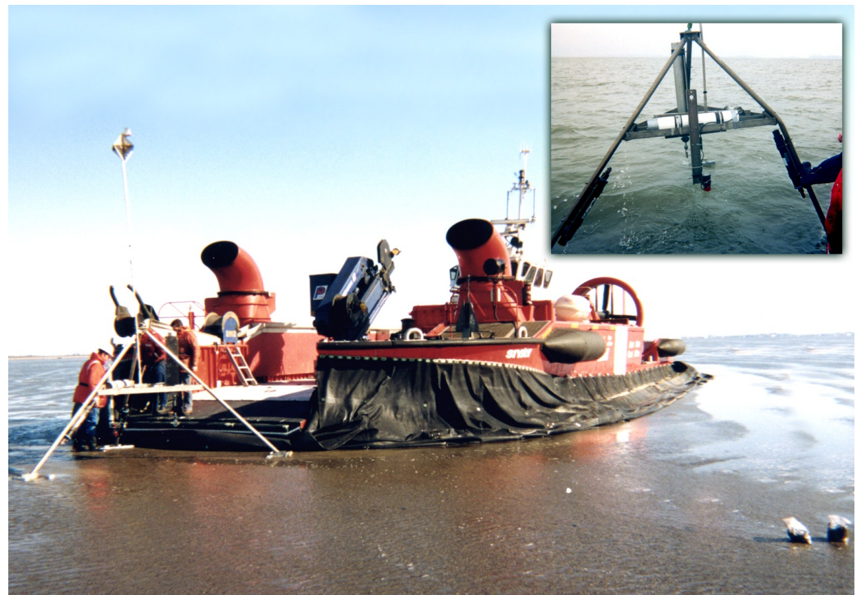
Fig. 1. Norton being deployed on Roberts Bank using the Canadian Coast Guard hovercraft Siyay . A relatively easy deployment, and we knew that it was deployed right-side-up. Insert shows the tripod being recovered. Two OBS sensors were attached to the legs, while the Imagenex scanning sonar (red head) and the Marsh McBirney flow sensor (black ball) were mounted in the centre of the tripod.